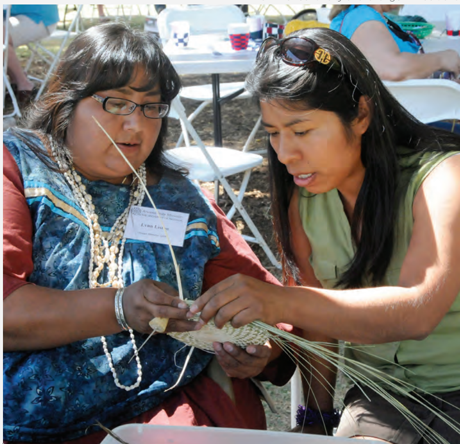
ASM 120: Continuity and Change in Traditions