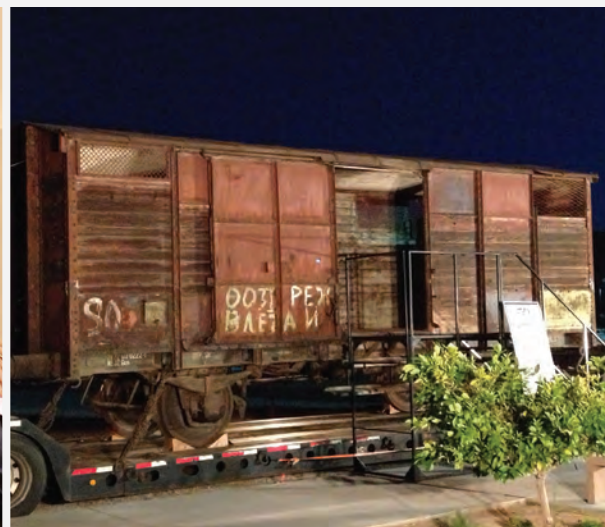
Holocaust-Era Railcar Exhibition