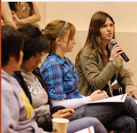
Hot Topics Café

We welcome proposals from a wide range of nonprofit organizations and encourage projects that are innovative in their approach toward the humanities and public programs.