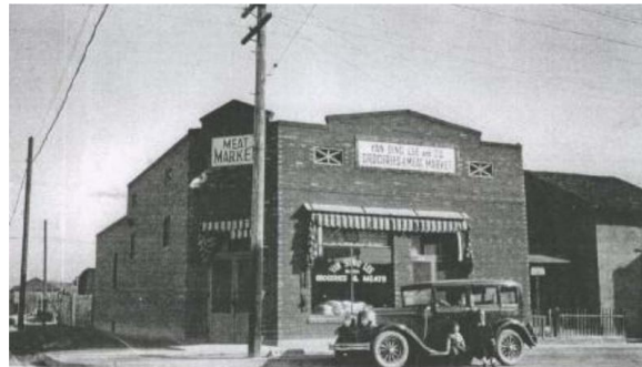
Yang Sing Lee Market, Tucson, est. 1906 and operated until 1955.

With support from an AHC project grant, the Tucson Chinese Cultural Center will host a day-long exhibit and programs titled, "The Vanishing Chinese Grocery Store," on Saturday, September 10, 2011, from 8:30 a.m. to 6:30 p.m. at the TucsonChineseCulturalCenter, Tucson. Working in collaboration with other Tucson-area nonprofits, including Sabores Sin Fronteras and Southern Arizona Food Traditions, the exhibit will feature an exhibit of historic photos and oral histories, presentations by humanities scholars, and cooking demonstrations by traditional Chinese chefs. Click here for more information.