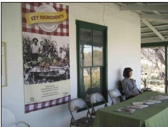
A volunteer welcomes people on opening day with local program schedules and Key Ingredients Recipe Cards.

In anticipation of the Smithsonian exhibition's arrival, OHS invited students to participate in Food Is Art , art-quilting workshops sponsored by the Arizona Commission on the Arts and hosted by RLV OracleArt and 4-H Desert Thunder on March 5 and 6. Workshop leaders helped guide participants through interviewing family members and collecting recipes, stories, and photos, which were then integrated into wall hangings using traditional quilting techniques. The works were shown at the Key Ingredients Grand Opening, as well as during the Oracle Artists Studio Tour at the RLV OracleArt "Wilson Barn" on April 9 and 10.