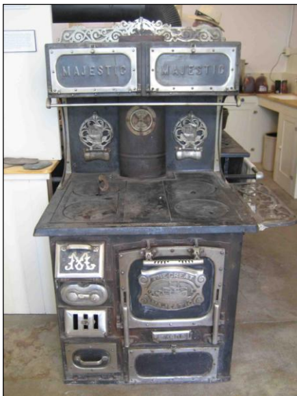
An antique stove at the Acadia Ranch Museum, part of the "Historic Kitchens and Cooks of Oracle" tour.