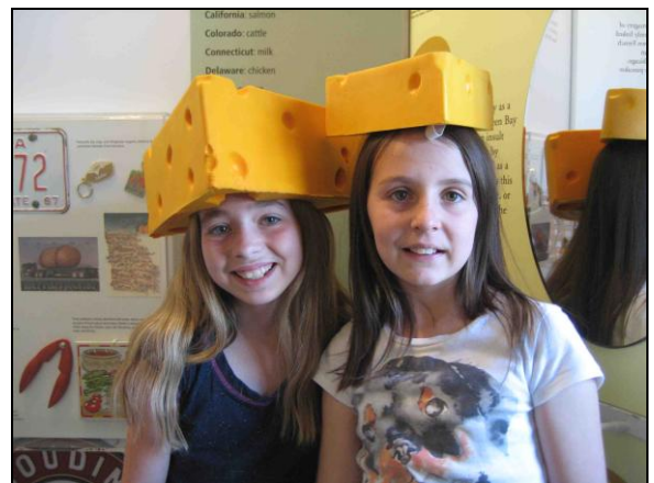
Young visitors enjoy the "cheeseheads" from the Smithsonian exhibition.